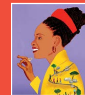
Illustration by Ellen Weinstein