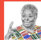
Illustration by Palesa Monareng