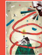
Illustration by Nate Kitch