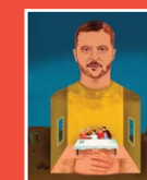
Illustration by Ellen Weinstein