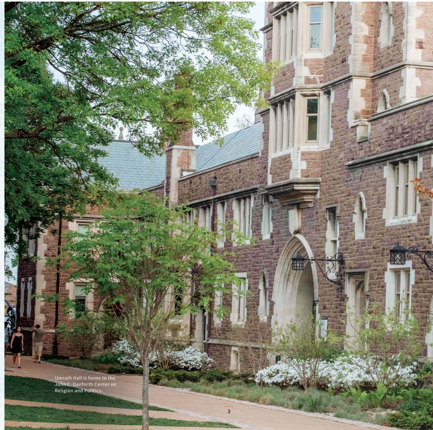
Umrath Hall is home to the John C. Danforth Center on Religion and Politics.