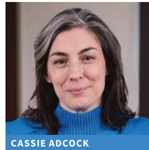
Associate Professor, Department of History; Associate Professor of Religion and Politics (by courtesy)