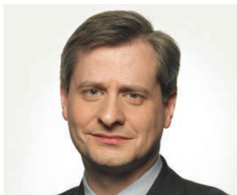
Jon Meacham (Chair) Executive Editor and Executive Vice President, Random House

Both as a group and as individuals, the National Advisory Board offers ongoing counsel and support to the Center. The board involves a group of distinguished representatives from the fields of American politics, religion, law, education, and journalism.