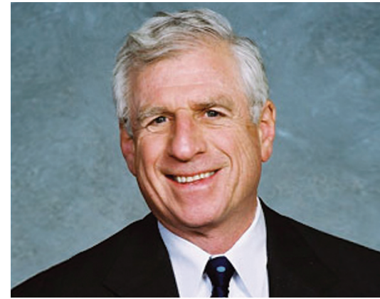
John C. Danforth

John C. Danforth developed the initial vision for the Center that is named for him. Danforth served in the United States Senate representing the state of Missouri as a member of the Republican Party from 1976 to 1995. His areas of interest included trade, tax policy and civil rights. In 1999, Danforth was appointed Special Counsel to investigate the federal raid on the Branch Davidian compound in Waco, Texas. Senator Danforth was appointed U.S. Ambassador to the United Nations in July 2004 by President George W. Bush. An ordained Episcopal priest, Senator Danforth presided over the funerals of President Ronald Reagan, Katharine Graham, and Senator John Chafee. He also authored the books Resurrection (Viking Press, 1994) and Faith and Politics: How the “Moral Values” Debate Divides America and How to Move Forward Together (Viking, 2006). His new book, The Relevance of Religion , will be published in 2015. Senator Danforth graduated with honors from Princeton University and then earned a Bachelor of Divinity degree from Yale Divinity School and a Bachelor of Laws degree from Yale Law School.