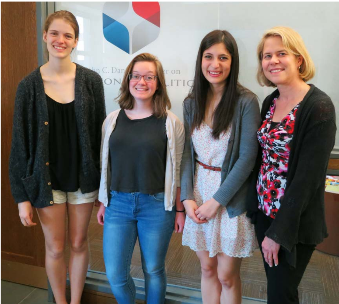
28 John C. Danforth Center on Religion and Politics

The Center’s undergraduate program offerings continue to grow, including a minor in religion and politics, which offers an interdisciplinary approach to draw on and contribute to relevant offerings from other academic programs on campus including Religious Studies, History, American Culture Studies, and African American Studies, among others. Students are given the analytical tools to examine with a broad, historical context current events such as church-state relations, gender and sexuality debates, and electoral politics.