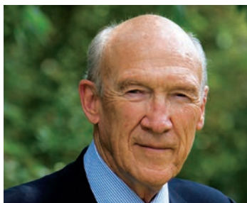
Alan K. Simpson Former United States Senator from Wyoming; Co-Chairman, National Commission on Fiscal Responsibility and Reform