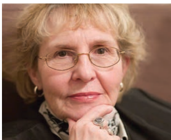
Jean Bethke Elshtain The University of Chicago In Memoriam 1941-2013