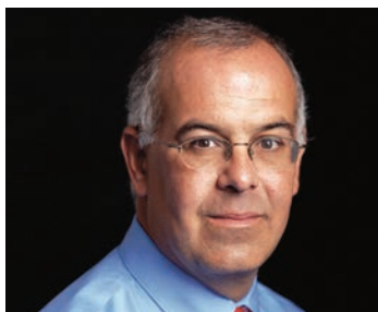
David Brooks Author and opinion writer, The New York Times