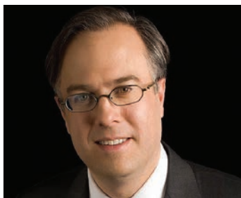
Michael Gerson Journalist and opinion writer, The Washington Post