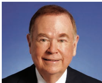
David L. Boren Former United States Senator from Oklahoma; President, University of Oklahoma