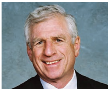
John C. Danforth Former United States Senator from Missouri; Partner, Dowd Bennett LLP